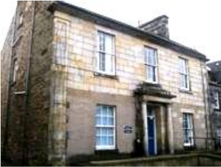
(situated opposite the Students' Union building)

The Chaplaincy Centre Mansfield Building University of St Andrews 3 St Mary's Place St Andrews Fife KY16 9UY